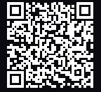
TSW030 360° VIEW

The TSW030 is a cost-efficient unmanaged Ethernet switch, featuring eight 10/100 RJ45 ports and integrated DIN rail mounting. This compact and rugged 8-port switch includes a 2-pin power input and low power consumption of up to 0.5 W when idle and a maximum of up to 1.5 W. These make this plug-and-play switch perfect for industrial applications requiring to connect up to eight devices.