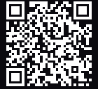
RUTM50 360° VIEW

RUTM50 is an FCC-certified Teltonika Networks cellular 5G router for North America, with ultra-high cellular speeds of up to 3.4 Gbps. This dual SIM router has auto-failover and backup WAN and supports both SA and NSA 5G architectures. It is also backward compatible with 4G (LTE Cat 19/18), making it perfect for future-proofing your industrial networking solutions.